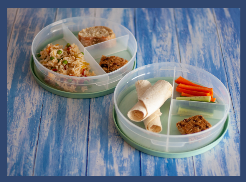
3 Compartment Dish & Lid Codes 496GREEN