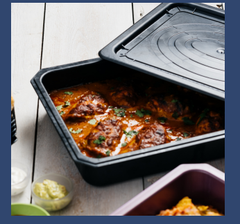
O2T 1/2 size GN & Lid Codes 064 & 066