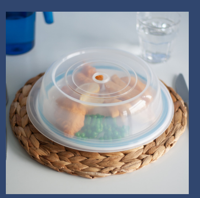
23cm Natural Plate Cover Code: 478NAT