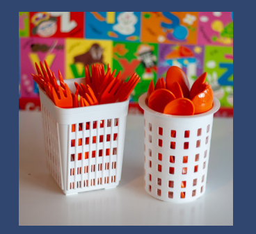
Cutlery Containers Codes 476 & 477