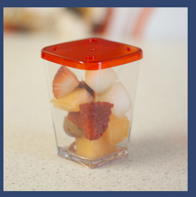
200/150ml Dessert Pot & Lids Codes 299/249 & 285/585