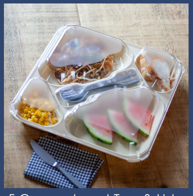
5 Compartment Tray & Lid Codes 735