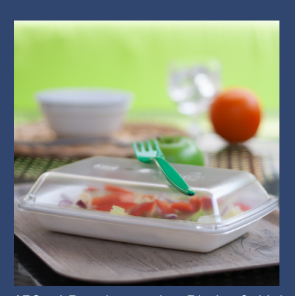
450ml Rectangular Plate & Lid Codes 412WHI & 413CLE

Contact us at info@dukefieldfood.com or tel: 01204 374 062 for more information.