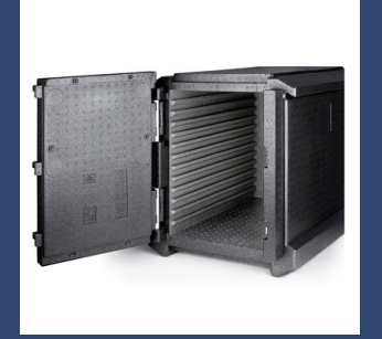
Front Loading Insulated Box Code 854BLA