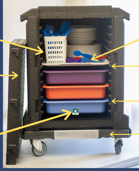
Code: 854BLA Front Loading Insulated Box Code: 860DOL Dolly for Front Loading Box

Labels to mark up the Gastronorms with food contents